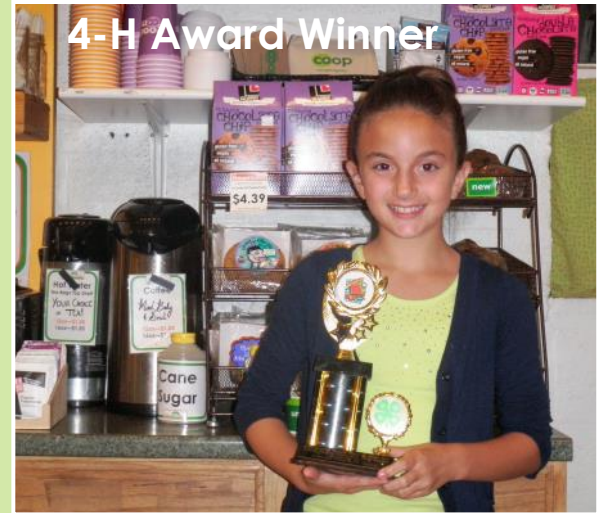
4-H Award Winner

CMU Earth Week, Mt. Pleasant Drillers Fundraiser, Mt. Pleasant Rotary Auction, my104.3 Boo Bash, United Way Festival of Trees, Isabella Community Soup Kitchen , Connections That Count, and the Mt. Pleasant Area Chamber of Commerce Rollie Denison Leadership Institute