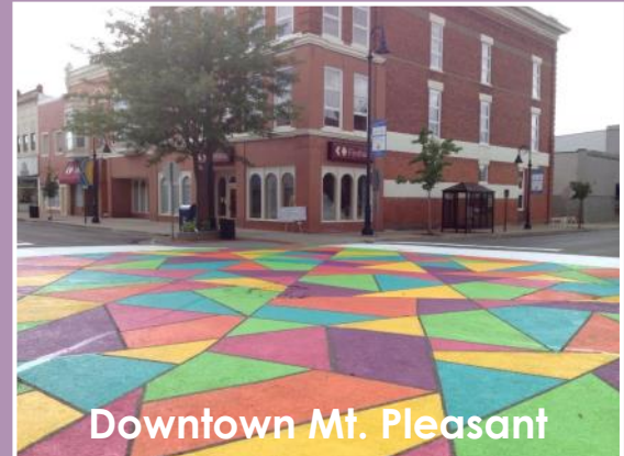
Downtown Mt. Pleasant

Connections That Count- In 2013 we began providing free lunches to CMU's Connections That Count, a service learning program that supports families who have children with special needs. We continued our support of the program in 2014. We typically provide 14 lunches per week.