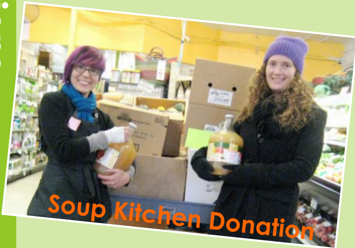
Soup Kitchen Donation