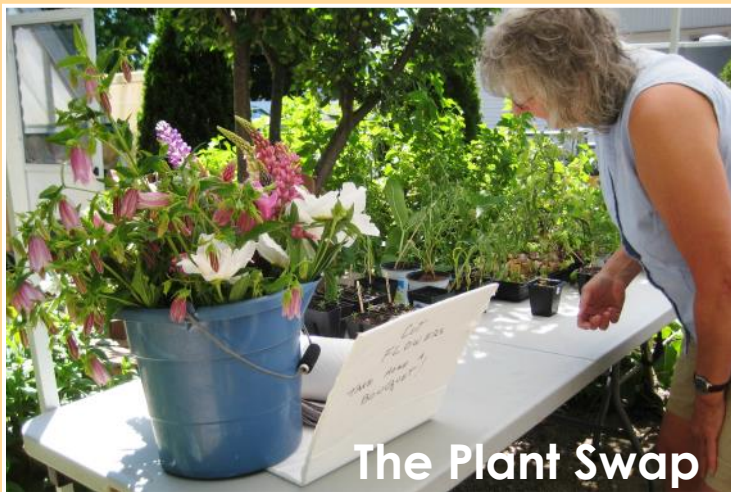
The Plant Swap